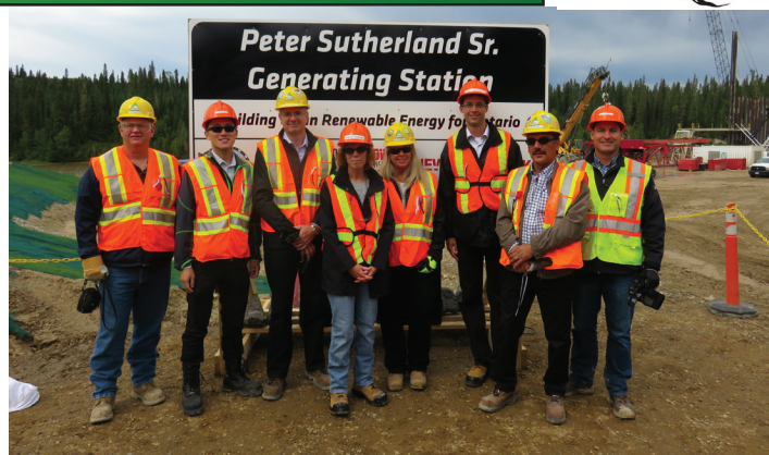
Part of the OPG, CRP, and KGS Project Team.