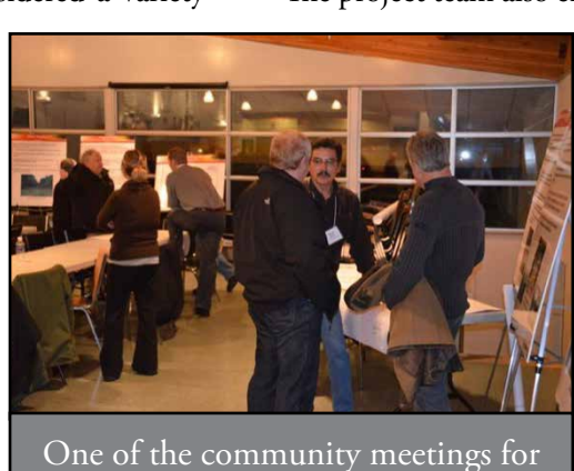
One of the community meetings for the environmental assessment.